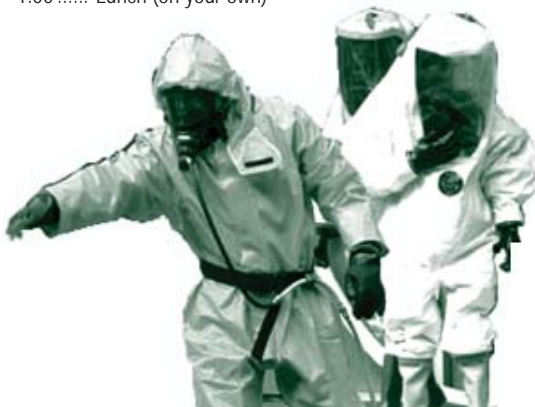
10 - HazMat Expo 10